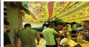
Relief Distribution at Sajeck(Upper) & Mohalchari(Bottom).