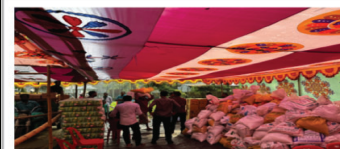
Relief Distribution at Char Motuya(Upper) & Kaladorap(Bottom).