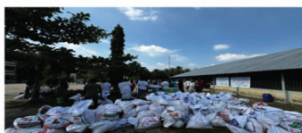
Relief Distribution at Ahwadiya(Upper) & Binodpur(Bottom).