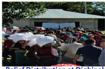
Relief Distribution at Dighinala(Upper) & Matirangha(Bottom).