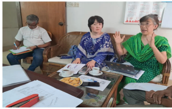
ALAP Group & BDP Board members meeting.