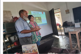
School Based Gardening Training In Netrokona.